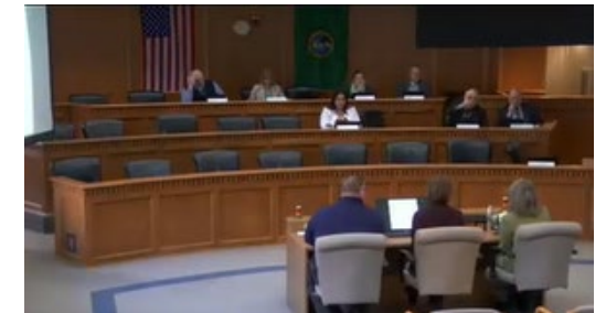
New Health Care and Fiscal Committee Members