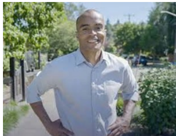
New Attorney General