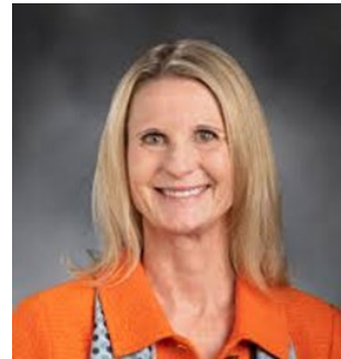
New Insurance Commissioner