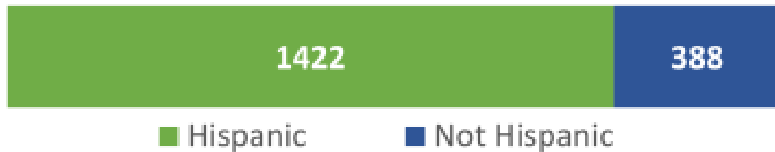
IHC customers by ethnicity

Among those reporting ethnicity, 79% of IHC customers report being Hispanic, compared to only 14% of the overall QHP population.