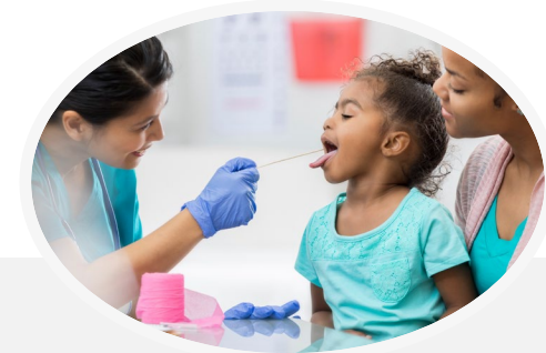
Fostering Health Equity

EXPERTISE APPLIED ACROSS ALL STRATEGIES: