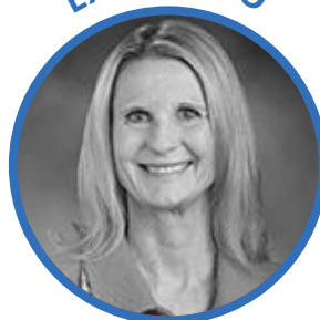
Patty Kuderer Washington State Insurance Commissioner